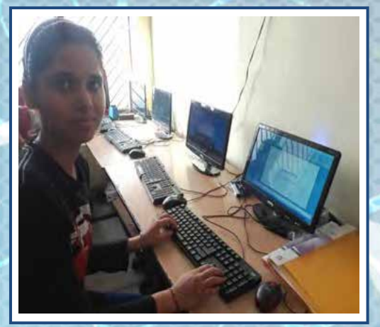
The E-Academy project is proud to have imparted education & training related to the use software like MS Office, Tally, Photoshop, etc. free of charge to 34 children of our artisans.