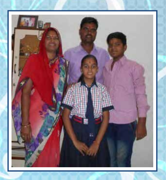
Educational Assistance amounting to Rs. 2,50,000 was provided to 100 children belonging to 95 Artisans from 26 of our Producers