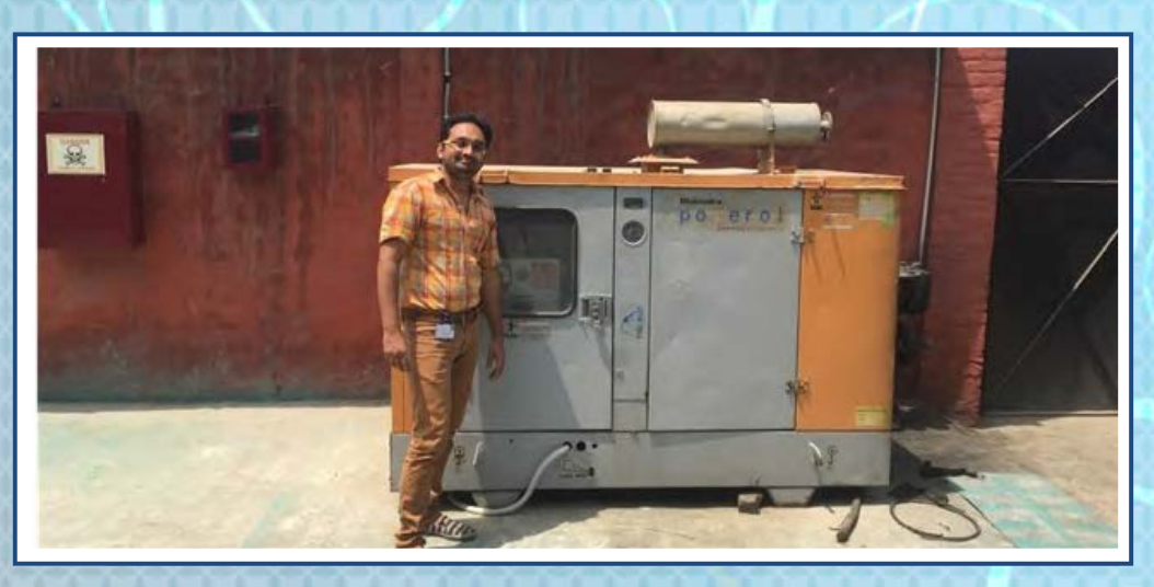
"With the grant I received from Asha Handicrafts, I have purchased a generator which has allowed me to continue production even during the regular power cuts"

(Producer Assistance for Improving Deliveries) Under this Project, 2 Producer groups were assisted with Advances totaling Rs. 2, 75,000