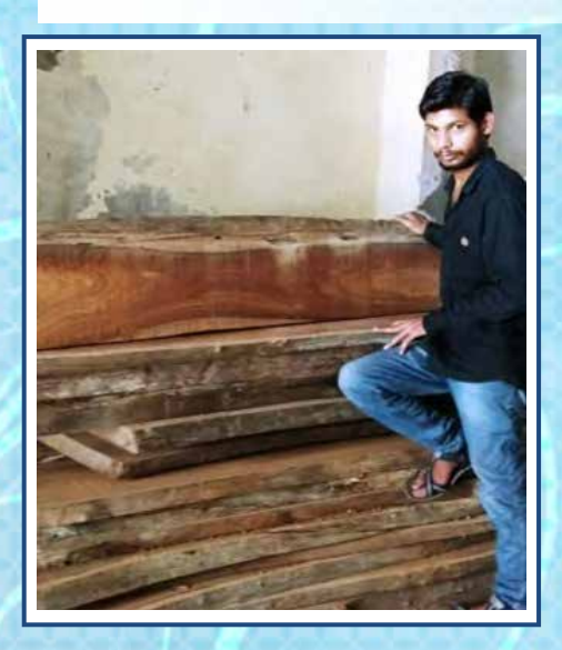
"I was able to deliver Quality Products on time because of the assistance I received from Asha Handicrafts."