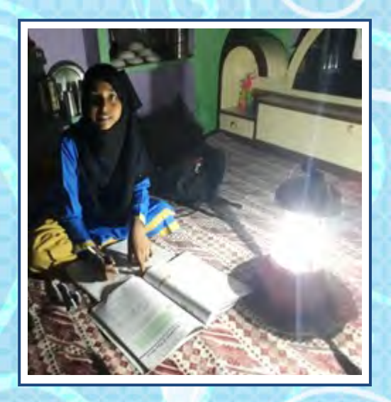
Solar Lanterns have been provided to the families of 40 Artisans from Saharanpur & Sarai Tarin with funds of US$ 1300 from SERRV.